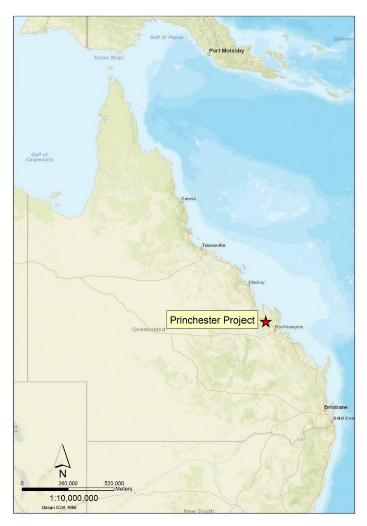
Figure 1: Location of Princhester Project, Queensland

The Princhester Magnesite Project is located in the northern New England Orogen, and within the Marlborough Province. The New England Orogen is a significant mineral province in eastern Australia, extending from Port Macquarie, New South Wales, in the south to north of Mackay, Queensland. The New England Orogen mineralisation includes significant gold mineralisation (Mount Morgan, Gympie) and various mineral deposit styles including mesothermal and epithermal gold, VMS, epithermal silver and lateritic nickel. The New England Orogen also contains economically important commodities including tin, sapphires, diamonds, molybdenum, tungsten, magnesite, cobalt and antinomy.