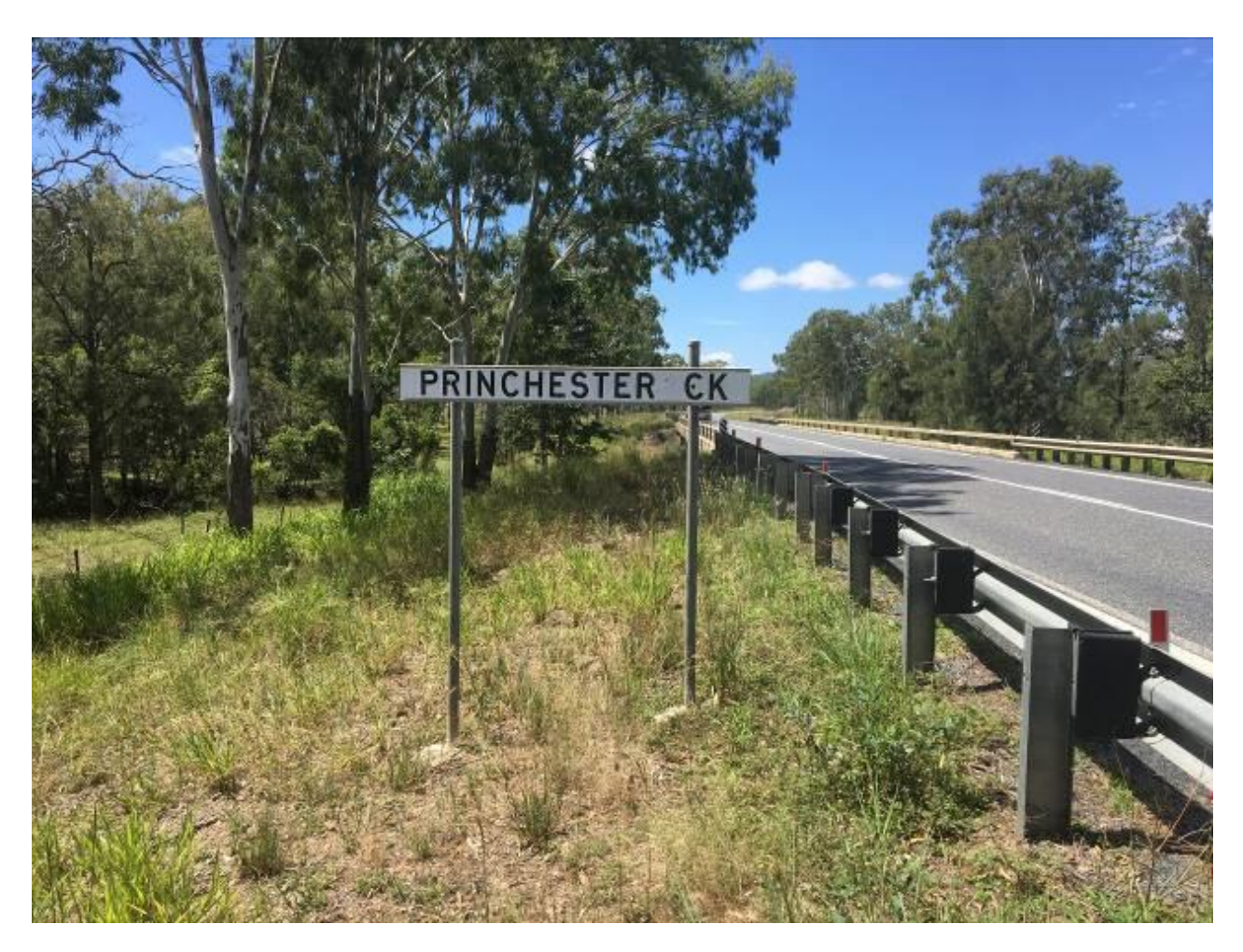
Figure 4: Princhester Project access via Bruce Highway

During March 2019 the Company completed a reconnaissance field visit to the Princhester project. The objective of the visit was to confirm historic information and provide confidence in the database and geological interpretation ( Figure 3 ). In addition the environmental impact of historic work was assessed and it was noted that the impact of the historic drilling has reduced through natural revegetation ( Figure 4 ). Local tracks and fencelines provide access and remain open. The Company is continuing to review the Princhester project Magnesite mineral resource and is assessing opportunities to further expand and define the zone of mineralisation.